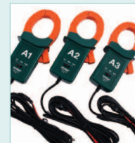
Model PQ34-12 1200A Current Clamp Probes with 2" (50mm) jaw opening