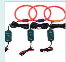
Model PQ34-30 3000A (24"/600mm) Flexible Current Clamp Probes for wrapping around busbars